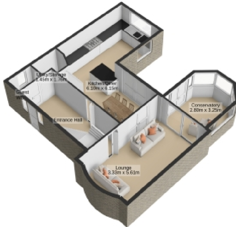
Ground Floor 734 sq.ft. (68.1 sq.m.) approx.