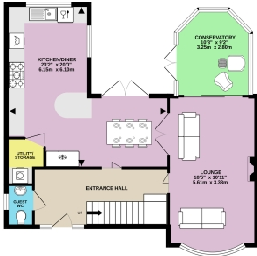
GROUND FLOOR 734 sq.ft. (68.1 sq.m.) approx.